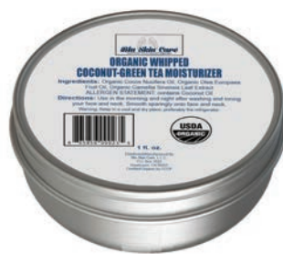
■ Blu Skin Care's USDA certified organic products include a whipped coconut-green tea moisturizer. $55 at bluskincare.info .

A vegan lifestyle focuses on more than just food. It also means avoiding animal products – even beeswax or honey. Here are a few to try.