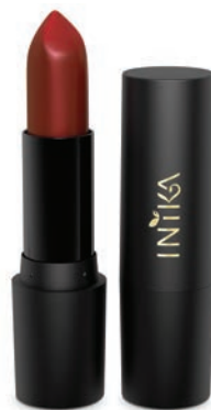
■ INIKA's organic, vegan and cruelty-free line includes lipsticks in fashionable colors. $29 at inikaorganic.com/us .