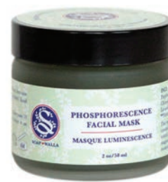
■ The Soapwalla brand is 100 percent vegan and cruelty free. Their phosphorescence facial mask soothes, clarifies and hydrates. $68 at soapwallakitchen.com .