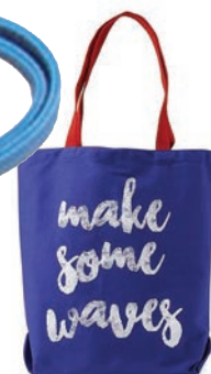
■ This Make Some Waves graphic tote can be your new beach bag. $4.90 at sears.com .