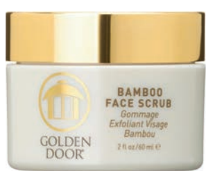
■ Profits from Golden Door's bamboo face scrub go toward efforts to end child abuse. $48 at shop.goldendoor.com .