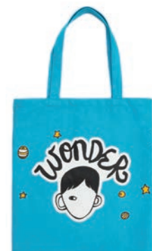
■ This tote, based on the book and movie, boasts an anti-bullying message. $18 at outofprintclothing.com .