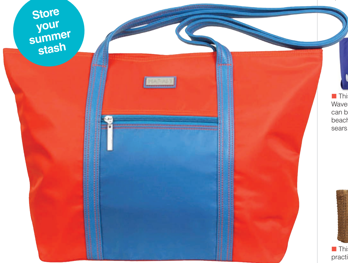
■ The Hadaki Cosmopolitan nylon tote bag comes in 11 color combos. $59.99 at Target.