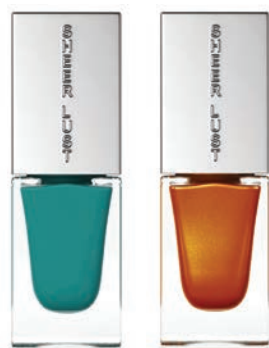
■ Sheer Lust is a vegan and cruelty-free nail lacquer line in today's hottest hues. $18 per bottle at sheerlust.com .