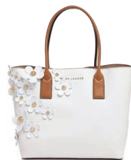
■ Marc Jacobs' Daisy tote is a fresh, summery addition to the accessory closet. $495 at Bloomingdale's.