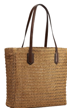
■ This straw tote practically screams summertime. $21 at Old Navy.