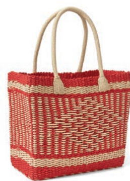
■ The boxy diamond weave tote sits up on its own, making it convenient for loading up. $35 at Gap.