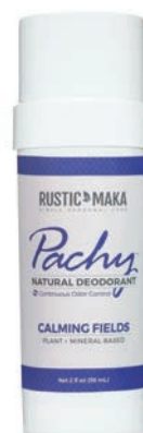
■ Made with lavender and spearmint, PETA-certified Pachy natural deodorant neutralizes odor. $9.95 at rusticmaka.com .