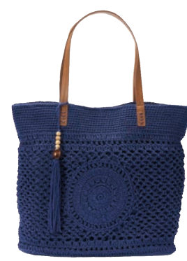
■ Sonoma Goods for Life crochet beaded tassel tote, $29.99 at Kohl's.